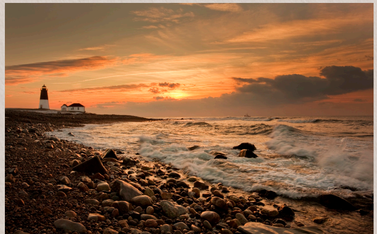
RIBC's Passport Program Image: A New Day, 2011