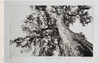
Elegant Elm 2011